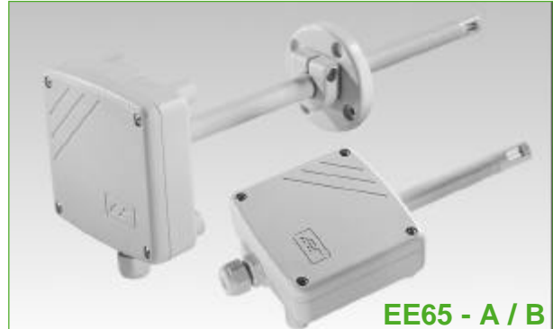
EE65 - A / B

Low angular dependence enables easy, cost-effective installation. An integrated LCD display and a version with remote sensing probe are available.