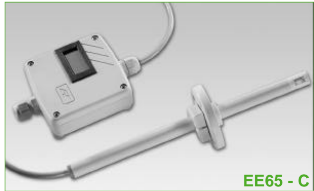
EE65 - C