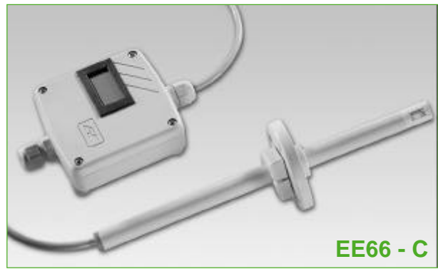
EE66 - C