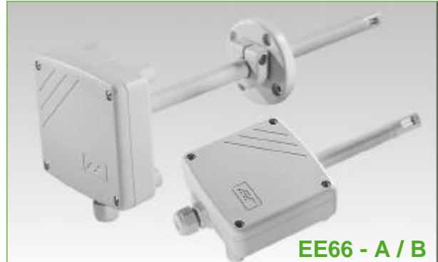
EE66 - A / B

An integrated LCD display and a version with remote sensing probe are available.